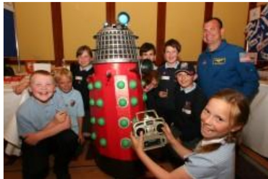
Newlands Primary, Borders, used the kit to build a replica Dalek!